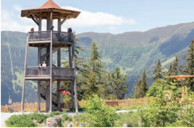
Wode tower, Ladis.

Once upon a time a legendary giant lived in the mystical forest above the Gasthof Neuegg. An oasis of quiet and relaxation with a kids' playground and a barbecue area! A pleasant circular hiking trail runs beside the Wode bath with many amazing and relaxing stations. Not far from the Wode bath is the beautiful and quiet secluded location of the Wode tower at an altitude of 1,487 m, which offers a breathtakingly beautiful panoramic view of Ladis, the Inntal and the Kaunertal valley.