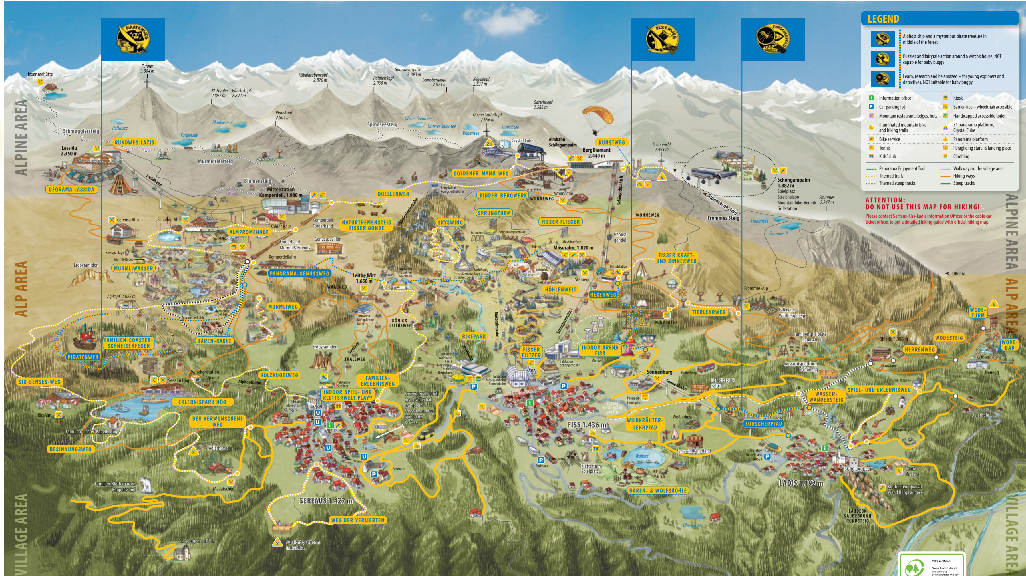
Legal notice: Design/concept: Serfaus-Fiss-Ladis Tourist Board | | | Printed by: Johann Sandler GesmbH & Co KG, Marbach | The information on these pages has been compiled with great care but is always subject to change. The publisher, however, shall not be held liable for such changes.