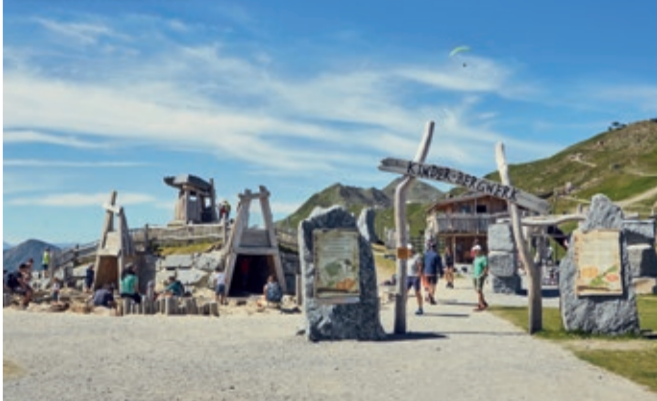
Children's Mine, Fiss.

The circular path near Fiss winds harmoniously through the gentle, hilly landscape and is well worth a visit – if only possible a feast for the eyes. On the banks of the lake, a top-class sensory experience for adventurous and curious kids. Here they can playfully learn about the behavior and lifestyle of the lynx, wolf and bear.