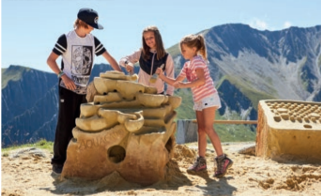
Georama Lassida, Serfaus.

The Georama Lassida at 2,350 meters above sea level opens an insight to the world of geology and archaeology for all explorers and hobby scientists. At its linchpin – the giant excavation area made of sand – various fossils are hidden. Equipped with a shovel and a hand brush, the mission is to find them. That's how searching for fossils becomes a true adventure for the whole family. The Lassida restaurant inspires with a panoramic terrace, homemade wood-fired pizza, Tyrolean culinary delights and homemade ice cream.